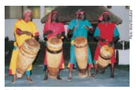
The Zambian National Dance Troupe

There is an important relationship between IP 'protection' and 'preservation/safeguarding' in the cultural heritage context. For example, the very process of preservation (such as the recording or documentation and publication of traditional cultural materials) can trigger concerns about lack of IP protection and can run the risk of unintentionally placing TCEs in the 'public domain': thus leaving others free to use them against the wishes of the original community. Or, unless handled carefully, it can mean that the person recording the traditional expression gains copyright over the form in which it is recorded (e.g. a photograph, film or sound recording of a TCE).